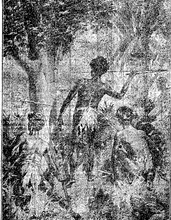
ABORIGINAL AUSTRALIAN CATTLE STEALERS.

CATTLE STEALERS IN AUSTRALIA tution, a man on the moon would catel