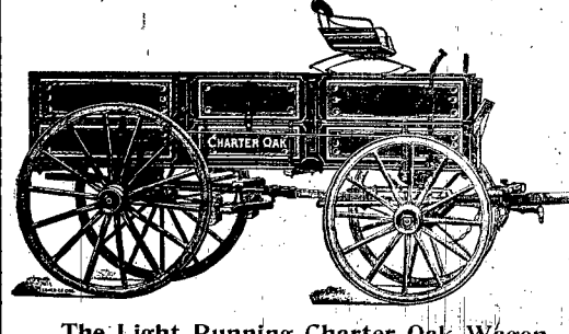
The Light Running Charter Oak Wagon

If you are thinking of buying a wagon don't tail to see the Charter Oak wagon before buying. They are the best wagon on wheels.